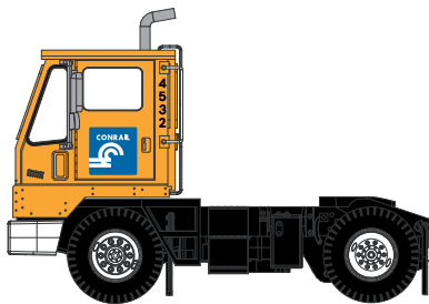
___ 29114 Conrail