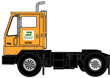
___ 29112 Burlington Northern