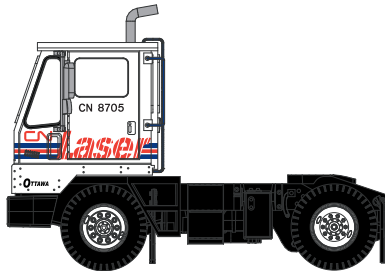
___ 29113 CN Laser