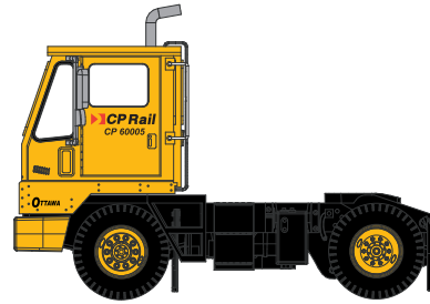
___ 29115 CP Rail