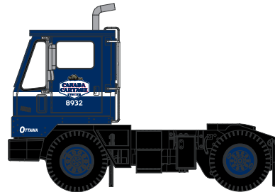
___ 29118 Canadian Cartage $19.98