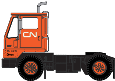
___ 29119 Canadian National $19.98