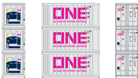
ATH17730 N RTR 20' Reefer Container, SZLU (3)