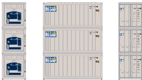
ATH17732 N RTR 20' Reefer Container, BMOU (3)