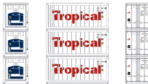
ATH17729 N RTR 20' Reefer Container, TTRU (3)