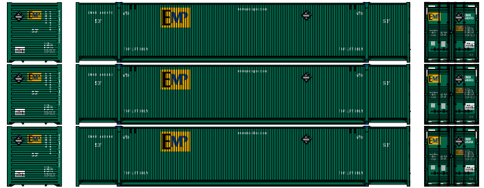
ATH26645 HO RTR 53' CIMC Container, CSX #1 (3-PACK) ATH26646 HO RTR 53' CIMC Container, CSX #2 (3-PACK)