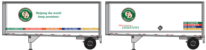
ATH2298 N 28' Trailers w/Dolly, Old Dominion