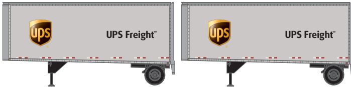
ATH2293 N 28' Trailers w/Dolly, UPS