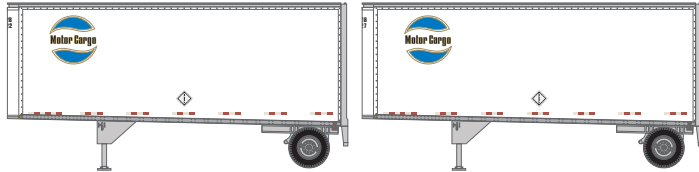
ATH2295 N 28' Trailers w/Dolly, Motor Cargo