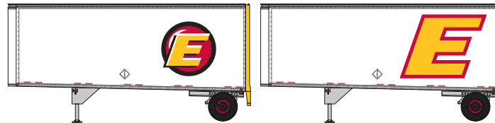
ATH29046 HO RTR 28' Trailers w/Dolly, Estes