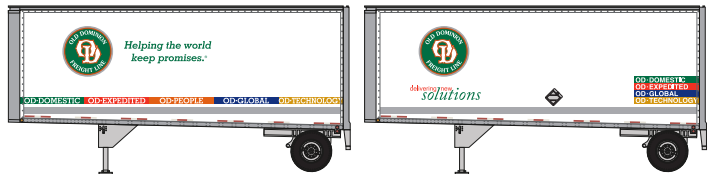
ATH29045 HO RTR 28' Trailers w/Dolly, Old Dominion