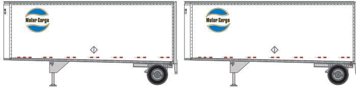
ATH29042 HO RTR 28' Trailers w/Dolly, Motor Cargo