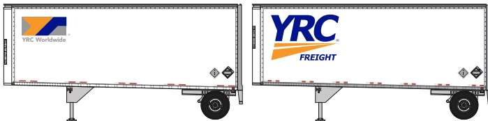
ATH29044 HO RTR 28' Trailers w/Dolly, YRC