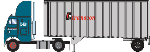
ATH91069 HO RTR FL-2 Axle w/28' Trailer, Transcon