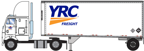
ATH91070 HO RTR FL-2 Axle w/28' Trailer, YRC