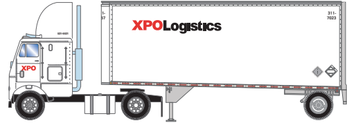
ATH91067 HO RTR FL-2 Axle w/28' Trailer, XPO