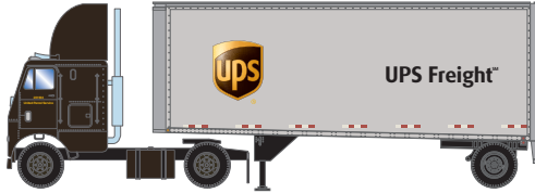
ATH91066 HO RTR FL-2 Axle w/28' Trailer, UPS